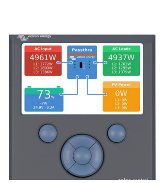
Color Control GX, showing a PV application

When connected to the Ethernet, systems with a Color Control GX or other GX device can be accessed and settings can be changed remotely.